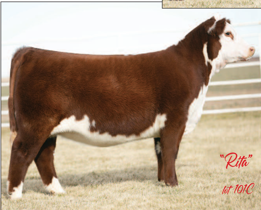
"Rita" lot 101C