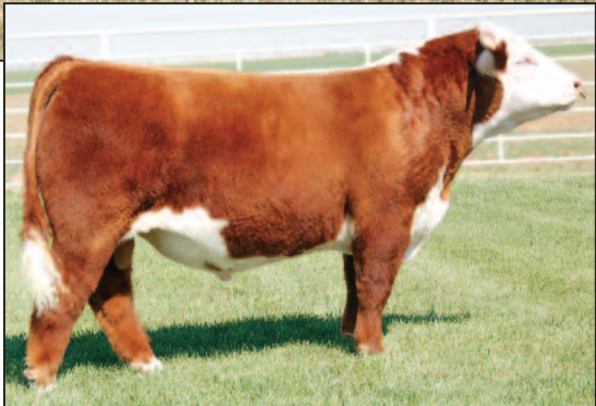
BR SOONER ON SOONER Sire of Lot 15