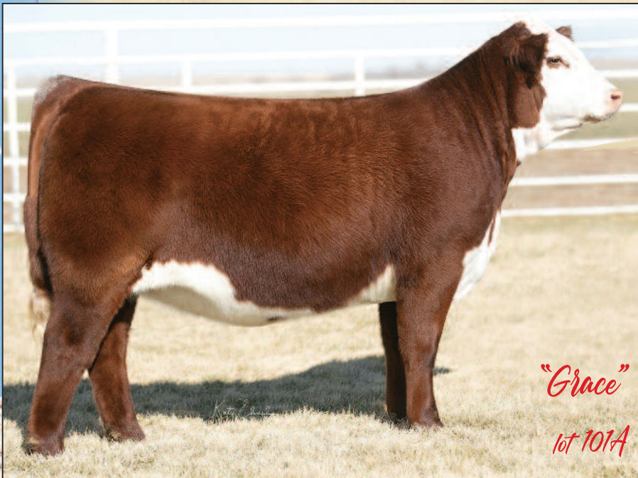
"Grace" lot 101A