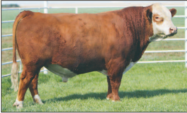
KCF BENNETT B716 D594