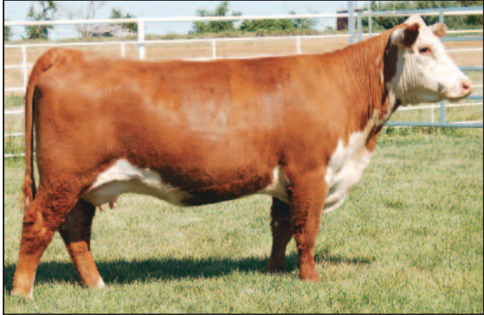
BR VIRGINIA GAEA 4073 Dam of Lot 15