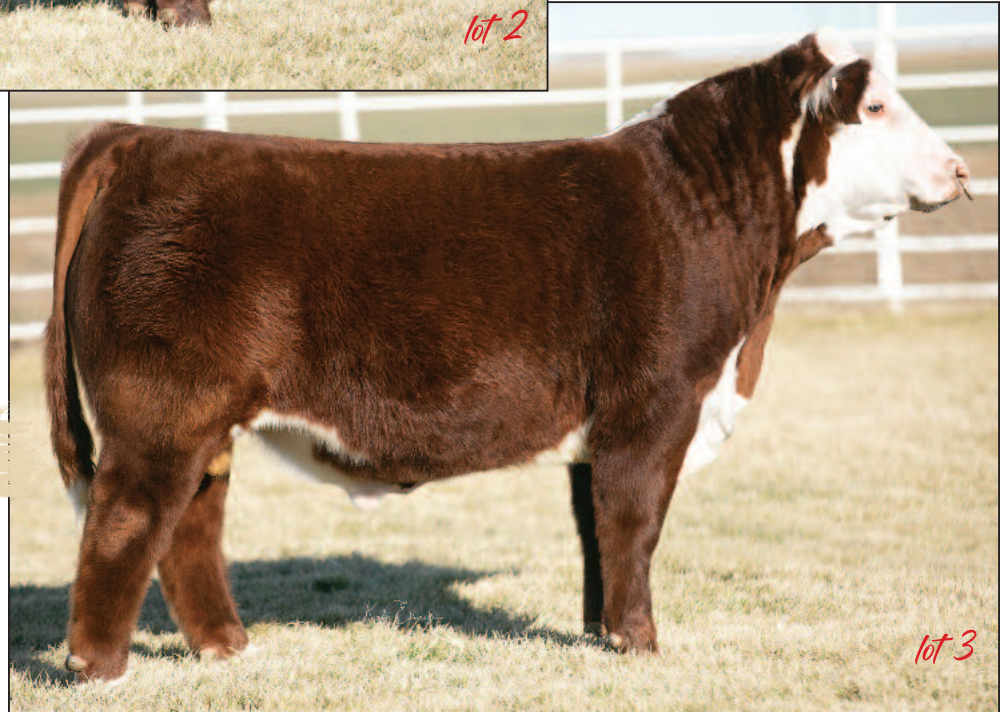
Denver Pen of Three Bull

Yearling weights & ultrasound data on the spring bulls will be available at the sale.