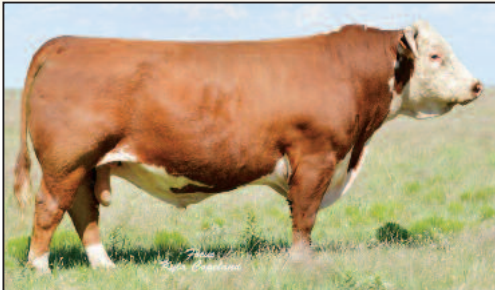
BR COPPER 124Y Sire of Lots 46 & 47