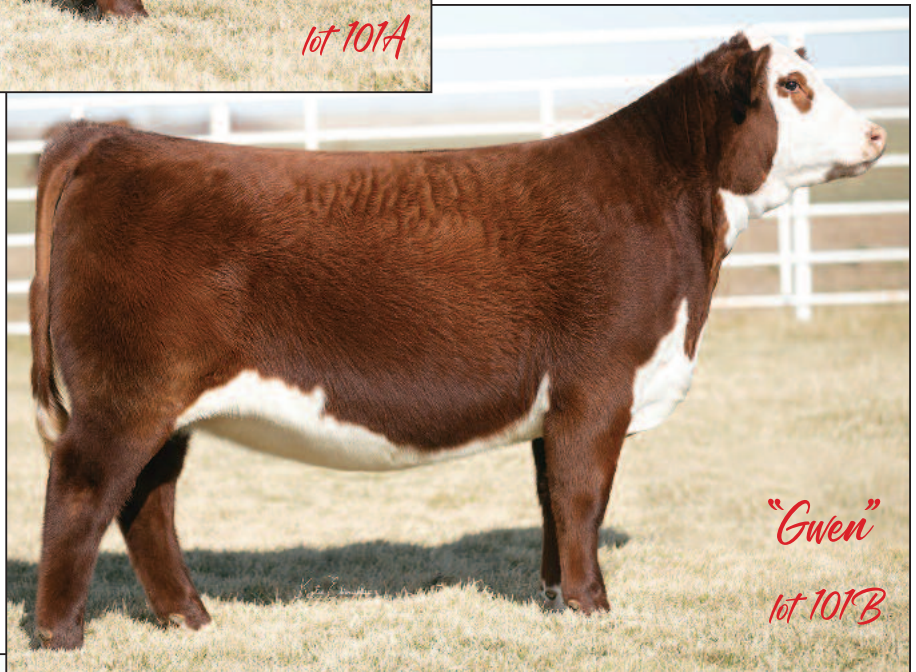
"Gwen" lot 101B