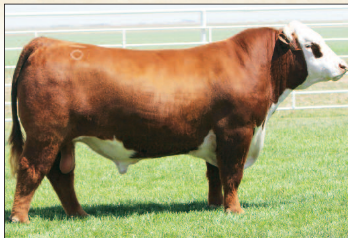
BR BELLE AIR 6011