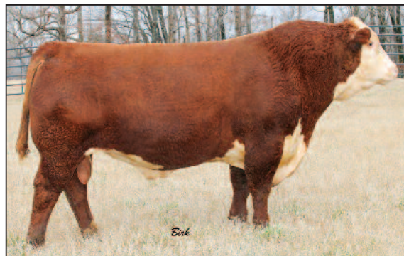
GERBER ANODYNE 001A