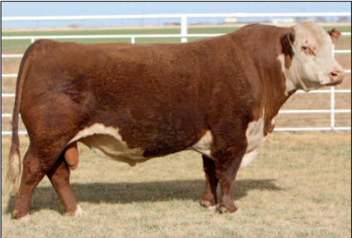
BR HUTTON 4030ET Sire of Lots 1-10