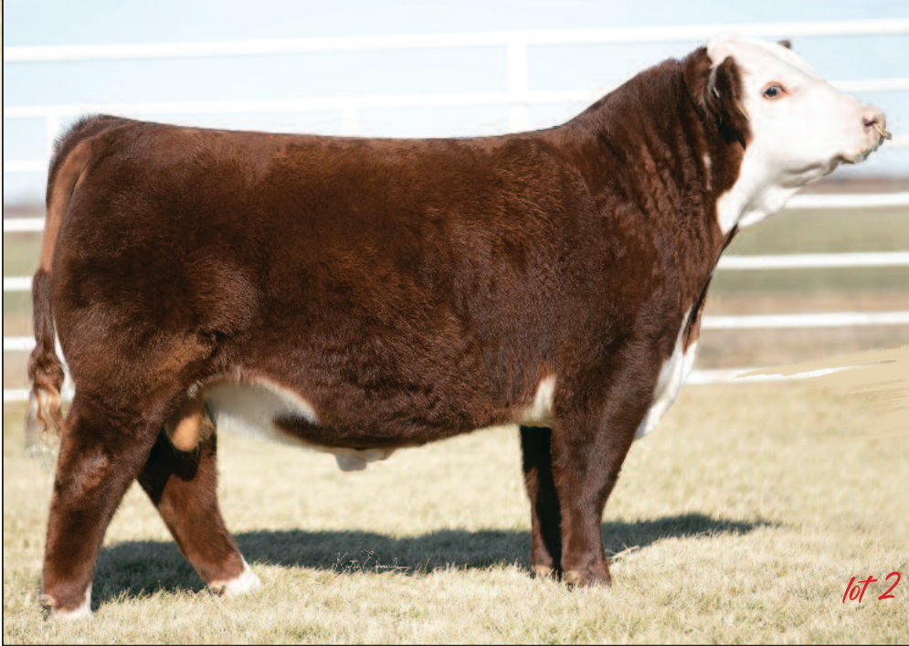
Denver Pen of Three Bull