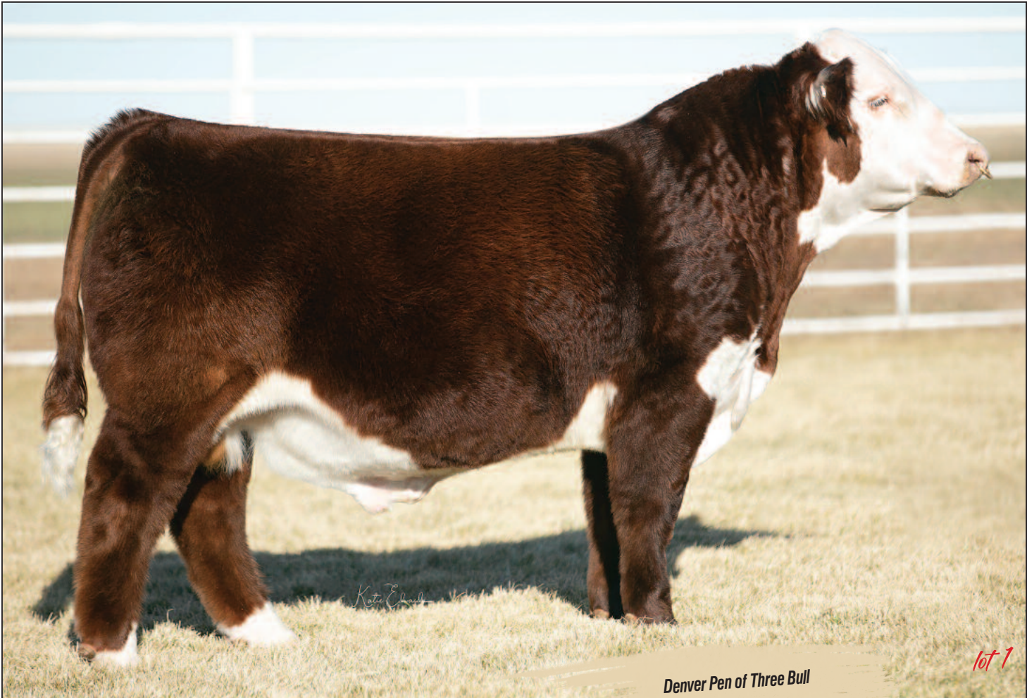
Denver Pen of Three Bull