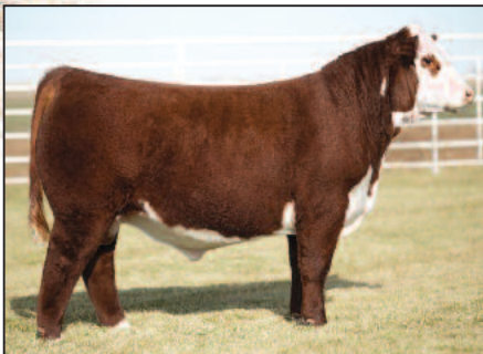
LOEWEN GENESIS G16 ET $100,000 full brother to Lots 101A-B-C

Selling 1/2 interest in choice of Lot 101A, 101B or 101C