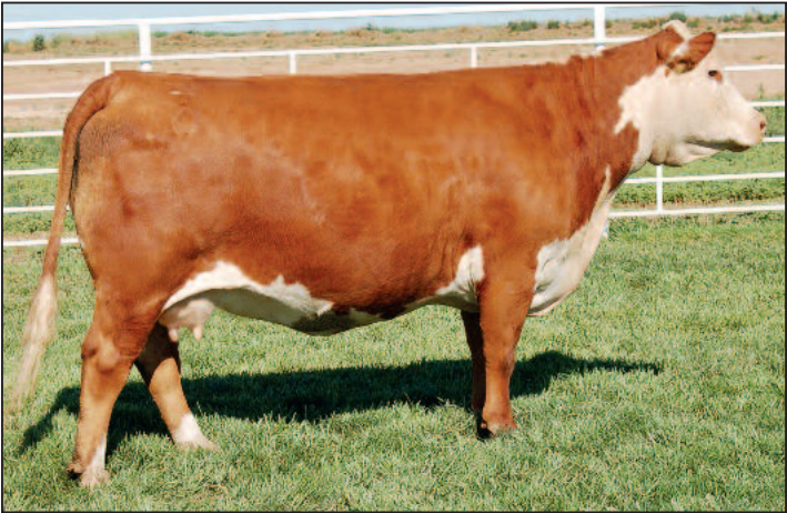
BR CSF GABRIELLE 8051 ET Maternal granddam of Lots 43-45