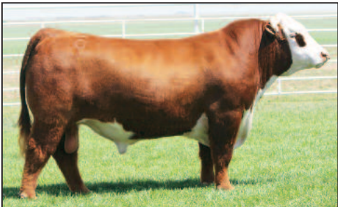
BR BELLE AIR 6011 Sire of Lot 41