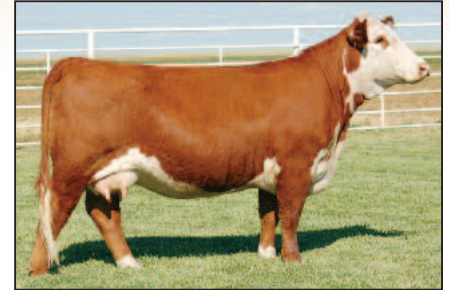
BR VERONICA 5019 ET