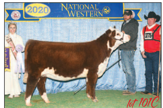
LOEWEN DMF RITA B42 G21 ET

2020 NWSS Reserve Champion Polled Junior Heifer Calf