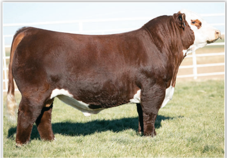
BR TRENDING K014 ET Sire of Lot 90

Join us March 19th in Desdemona, Texas, or online at live-ag.com or liveauctions.tv for an outstanding selection of both calving ease and performance bulls!