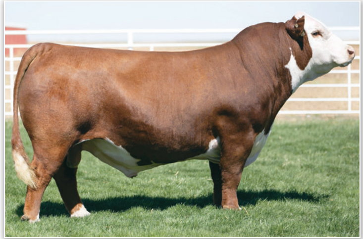
BR RARE AIR ET 11 grandsons sell

53 GKB 2175 RARE AIR 4804 P44610256 • DOB 10/14/24 • TAT. 4804 • Homozygous Polled {DLF,HYF,IEF,MSUDF,MDF,DBF}