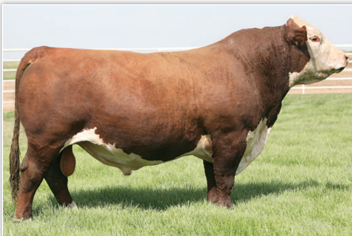
BR GKB TRENDING 0104 Sire of Lots 40-43