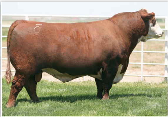
BR RARE AIR 2174 Sire of Lots 78 & 79