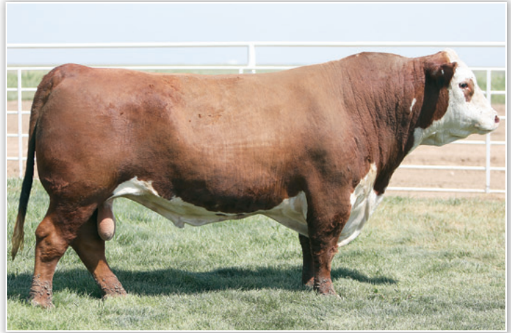
BR ENDURE 0159 Sire of Lots 44 & 45