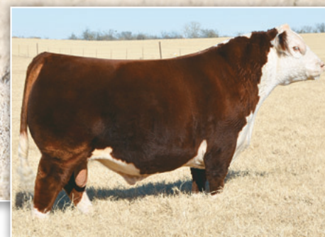
KLD RW MARKSMAN D87 ET Sire of Lots 66-68 & 70