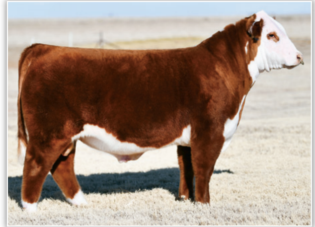
GREEN JCS MAKERS MARK 229G ET Sire of Lots 8-10 & grandsire of Lots 11-13