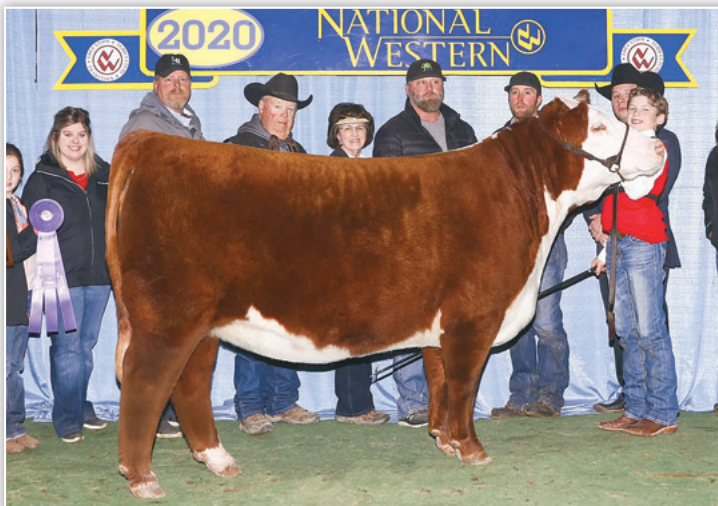
MCKY MONROE 8688 ET Dam of Lot 70

70 GKB MARKSMAN M175 ET P44610410 • DOB 11/10/24 • TAT. M175 • Scurred {DLF,HYF,IEF,MSUDF,MDF,DBF}