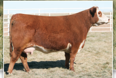
BR REVA 2369 Dam of Lot 1