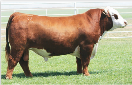
BR BELLE AIR 6011 Several grandsons sell