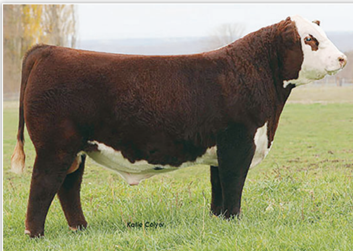
C GKB GUARDIAN 1015 ET Sire of Lots 27-31