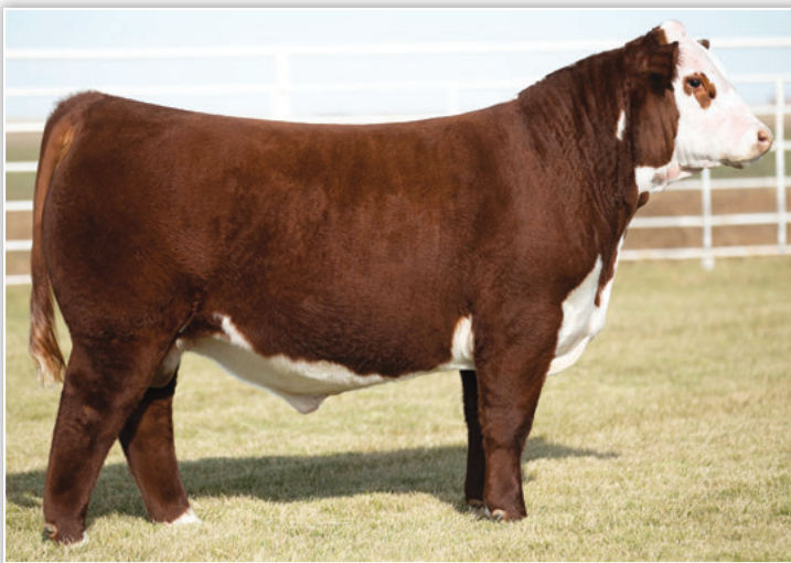
LOEWEN GENESIS G16 ET 31 grandsons sell