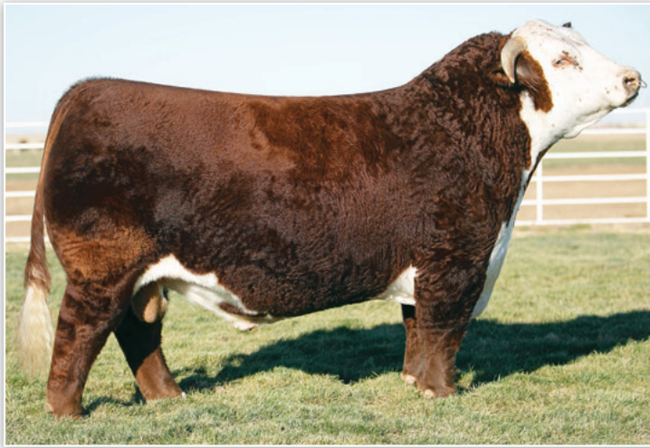
BR ER BIG COUNTRY 007 ET Grandsire of Lots 71-74