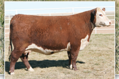
BR ANASTASIA 2309 Dam of Lot 2