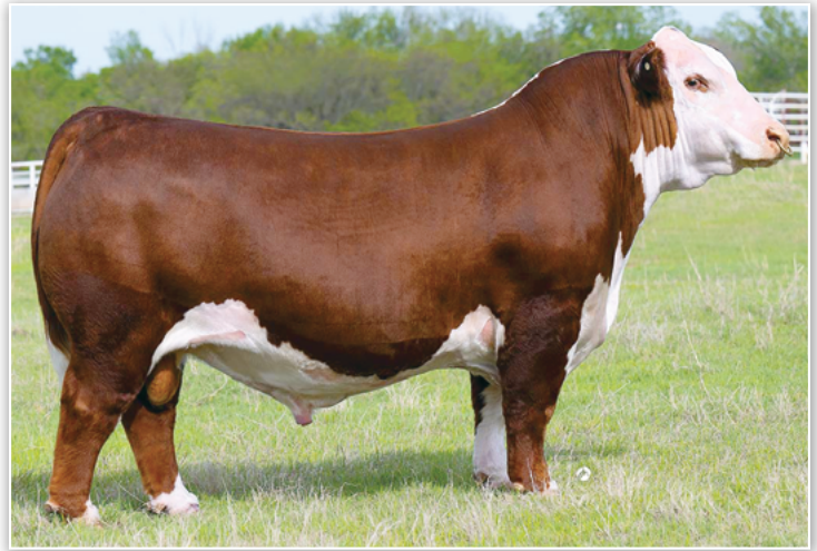
T/R GKB AC RED KINGDOM J16 Sire of Lot 69

68 GKB MARKSMAN 4671 44602074 • DOB 10/4/24 • TAT. 4671 • Horned {DLF,HYF,IEF,MSUDF,MDF,DBF}