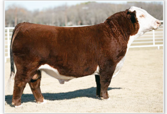
GKB CONAIR K102 ET Sire of Lots 76 & 77