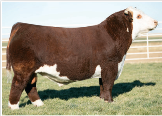
BR GKB WINCHESTER 1314 Sire of Lots 60-65