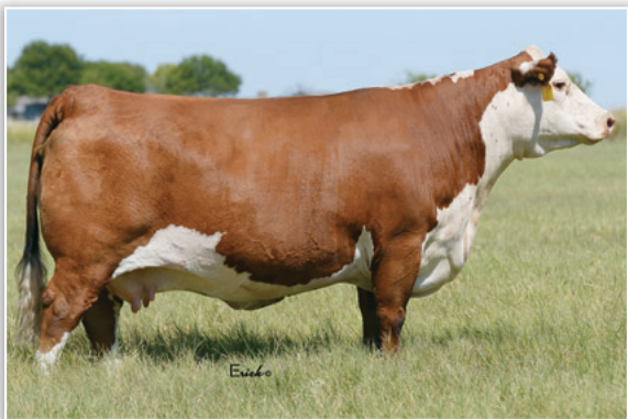
MM BRIELLE 1105 ET Dam of Lots 76 & 77