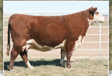
BR TERRI 2342 Dam of Lot 3