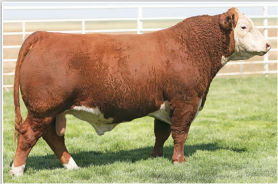
BR GKB CHARLIE 002A Sire of Lots 18-23