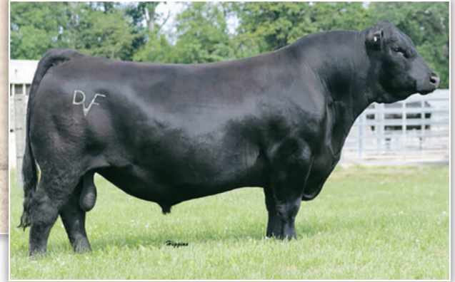
DEER VALLEY GROWTH FUND Grandsire of Lots 101-104

102 GKB GROWTH FUND 4582 *21107578 • DOB 8/31/24 • TAT. 4582 [AMF-CAF-D2F-DDF-M1F-NHF-OHF-OSF-RDF]