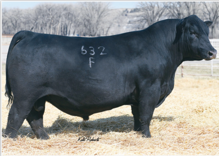
SITZ BARRICADE 632F Grandsire of Lots 109-115