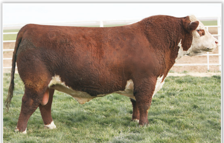
BR GENESIS J005 ET Sire of Lots 35–39