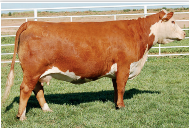
BR CSF GABRIELLE 8051 ET Third dam of Lot 11