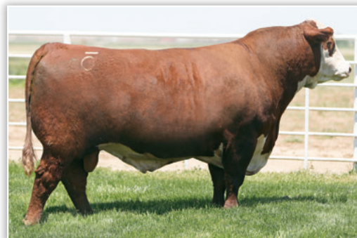
BR RARE AIR 2174 Sire of Lots 2 & 3

Member of the 2026 Denver Reserve Grand Champion Pen of Three Bulls